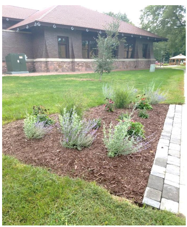
Butterfly Garden On West Sidewalk

As librarians, our job is to help young people find the right book for who they are now, without judgment.